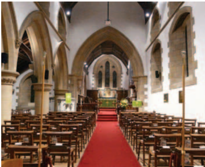
St. Giles Church, Bramhope