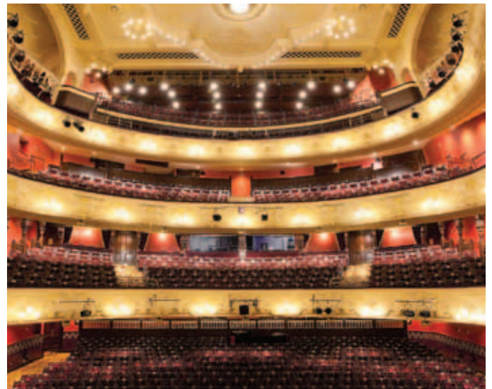
Newcastle Theatre Royal